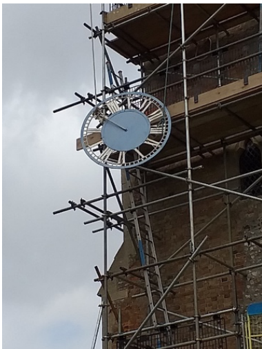
The clock face being lowered in April 2019. The mechanism was removed and restored at this time.

A clock with a pendulum dated 1865 made by Tucker of London was installed in the tower.