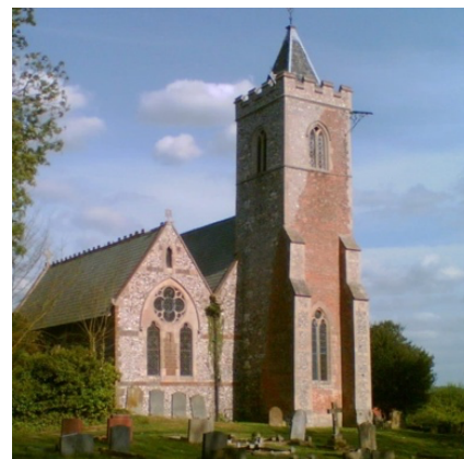
View of Ringstead Church from north-west by Bernard Birch