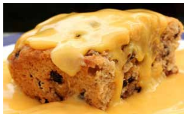
Traditional spotted dick sponge pudding

Cream margarine and sugar till light and fluffy Add eggs one at a time, beating well after each addition Coat the sultanas with a little of the flour Fold in remaining flour followed by the coated sultanas Put mixture into the greased basin Cover with grease proof paper Wrap the basin in tin foil Steam for one and a half hours to one and three quarter hours, making sure not to let it boil dry. Serve with custard or cream.