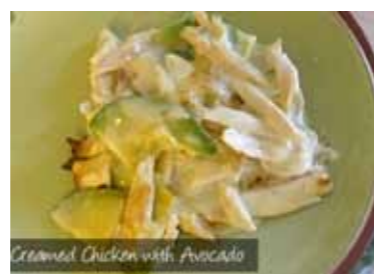
Creamed chicken and avocado

1lb / 450g cold cooked chicken meat cut into small strips 2oz / 50g butter 2oz / 50g plain flour Half a pint / 275ml of milk Quarter pint / 275ml of chicken stock Quarter pint / 150ml single cream 1 tablespoon dry sherry Some lemon juice 2 ripe avocados (these can be left out) 1oz / 25g mild cheddar cheese grated Salt and freshly milled pepper