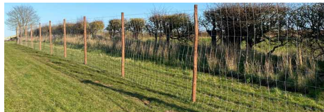
Fencing around ALDOGS MEADOW