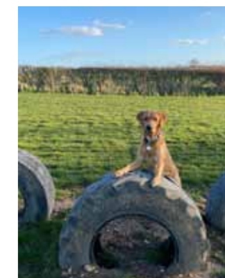
Enjoying ALDOGS MEADOW