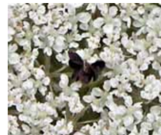
Wild carrot also known as Queen Anne's Lace- central floret in each umbel presented a dark reddish hue.

We were soon engrossed as the tiniest plants were examined with Sherlock Holmes precision. Thyme leaved sandwort was identified, Jersey cudweed was reduced to 'common' (still wearing its 'near threatened,' tag). Our plant list grew with every step Simon took. Scarlet pimpernel, bristly oxtongue, mugwort; each eagerly jotted down. Wort, we learned, was the worth of the plant, mugwort being used to flavour beer before hops were grown – so very worthy!