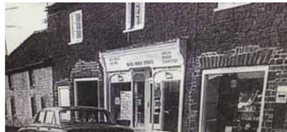
The village shop 1960's