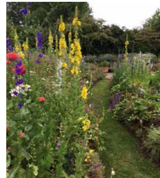
A view in Bridget Crowfoot's Garden

When planning commenced with covid restrictions still in place, we had no idea if people would want to come. However, as the time got nearer, my telephone started to ring non stop with bookings for lunch and we were soon full up! Some people come back year after year just for lunch, it has become quite famous!