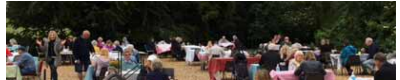
Visitors to the village enjoying lunch and light refreshments at Ringstead Open Gardens Sunday 27 June 2021