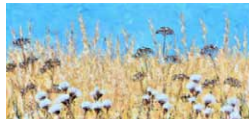
Thistle & Alexander in Golden Corn.