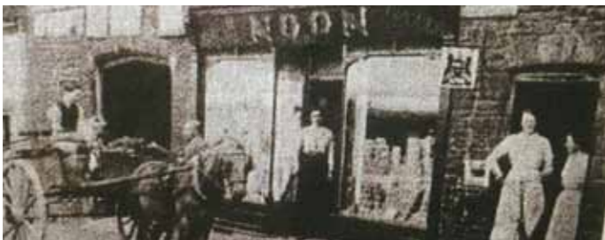
The village shop 1911