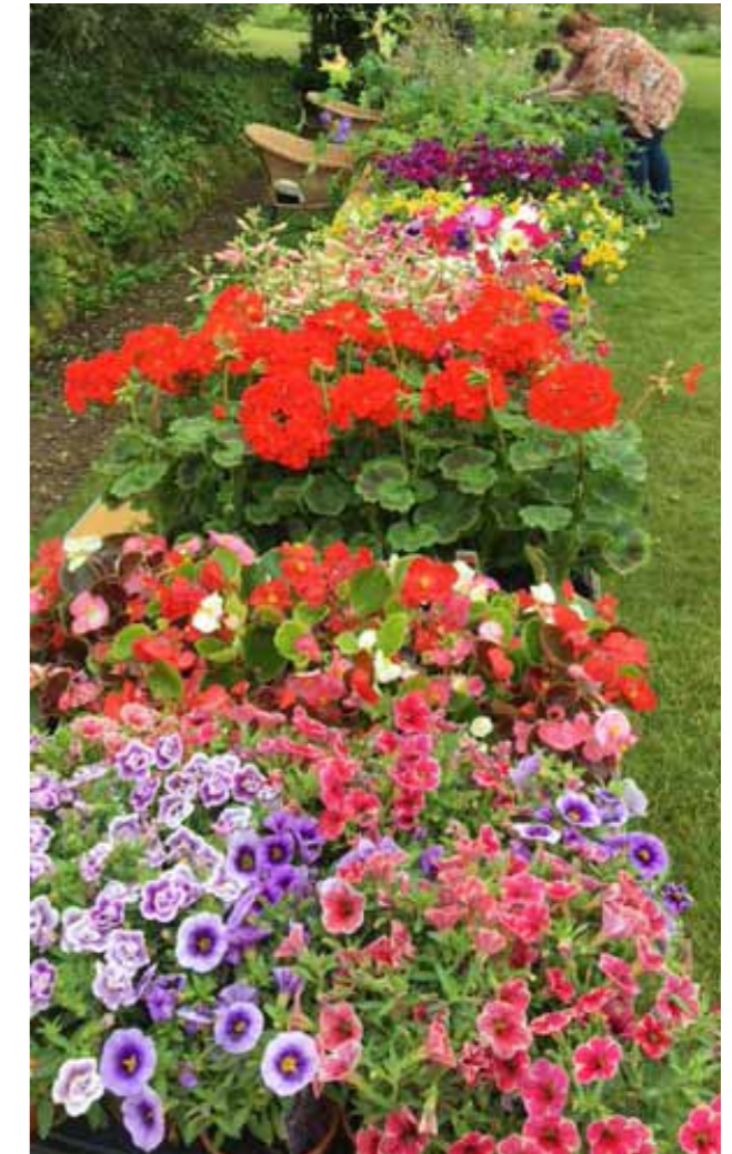
Garden plants for sale in Bridget's Crowfoot's garden in aid of The Village Club

Jane Whiteford did a marvellous job on publicity and the turnout was amazing. It was rather a cold windy day, but that did not dampen the mood, and everyone seemed to enjoy themselves so much. They were so appreciative of the lovely gardens and as always made a beeline for Bridget Crowfoot's plant stall (see photo). The tombola made £250 and thanks again to everyone who donated such brilliant prizes.